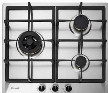
RB-63SSV-AL (AC) RB-63SSV-DL (DC)