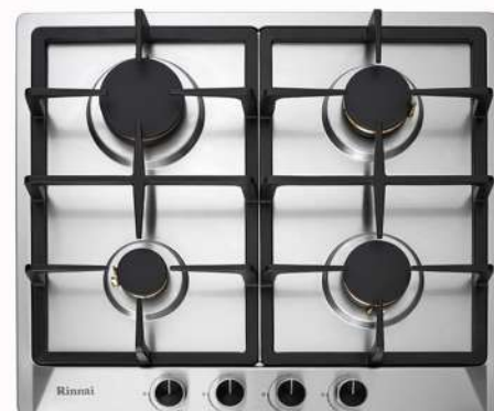
RB-64SSV-A (AC) RB-64SSV-D (DC)

Available for LPG/TG, and in AC/DC mode.