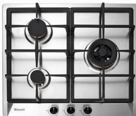
RB-63SSV-AR (AC) RB-63SSV-DR (DC)