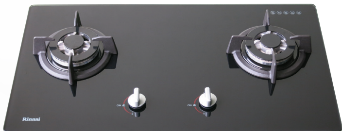
RB-7302S-GBS | 2 Burner Built-In Hob