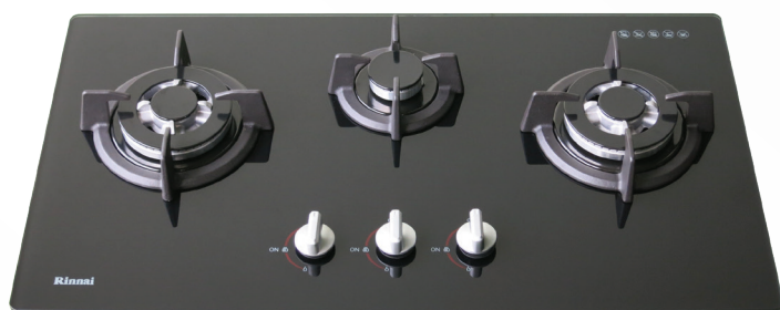
RB-7303S-GBSM | 3 Burner Built-In Hob