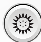
Semi Double Ring